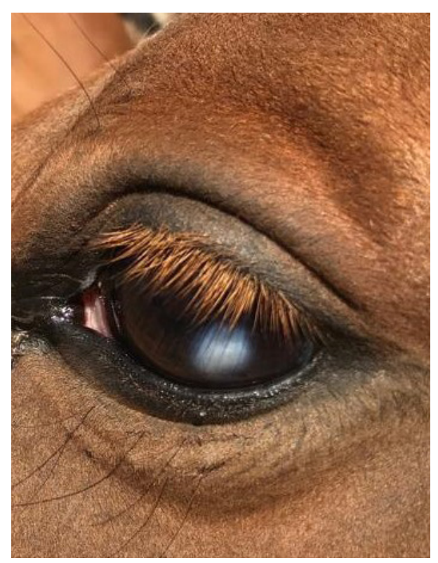
An obvious corneal ulcer

To examine the eye your vet may need to sedate your horse, plus or minus a nerve block to stop the blinking. A thorough examination of the surface of the cornea may require fluorescein staining as well as checking under the third eyelid for any hidden foreign bodies.