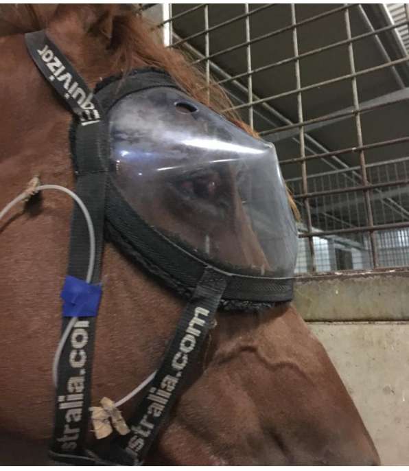
Catheter inserted to deliver medications

Treatment of most corneal ulcers is straightforward with topical antibiotics, atropine and anti-inflammatories, as well as keeping the eye out of bright sun, wind, and dust, preferably in a box with some sort of eye patch. Some horses struggle with the concept of eye drops and may require hospitalisation or the placement of a treatment catheter that is placed under the eyelid. A long tube is fed back and plaited into the mane so that medications can be administered much more easily.