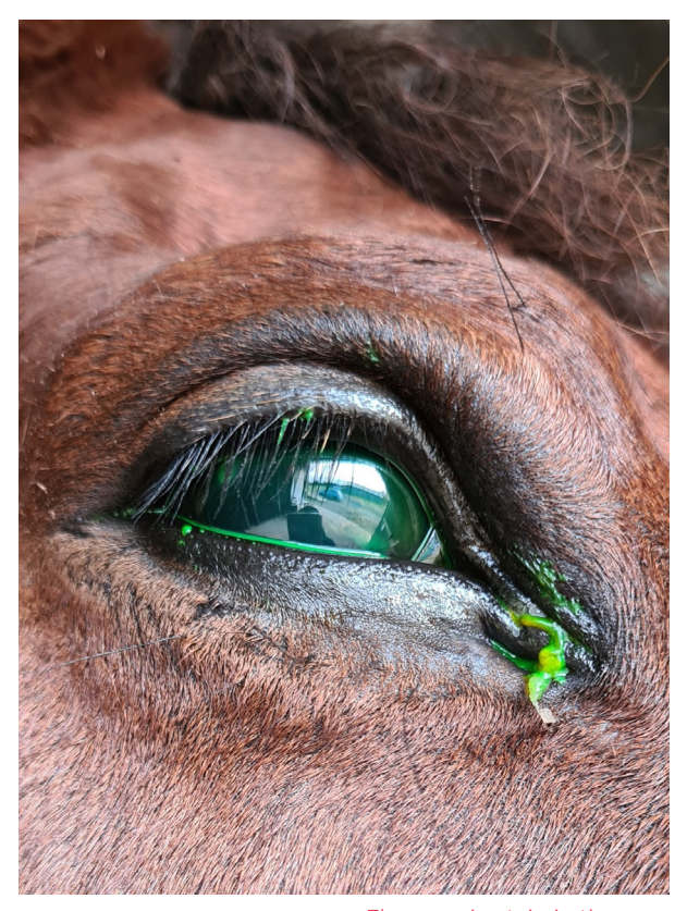
Fluorescein stain in the eye.

The most important thing to remember is that a painful eye needs urgent veterinary attention. If unsure, you can always send photos or a short video to your vet to give them an idea of how urgent the eye problem may be.