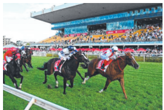
Giga Kick wins the Group 1 Doomben 10,000 in 2023.

Grace Grace is Minister for State Development and Infrastructure, Minister for Industrial Relations and Minister for Racing